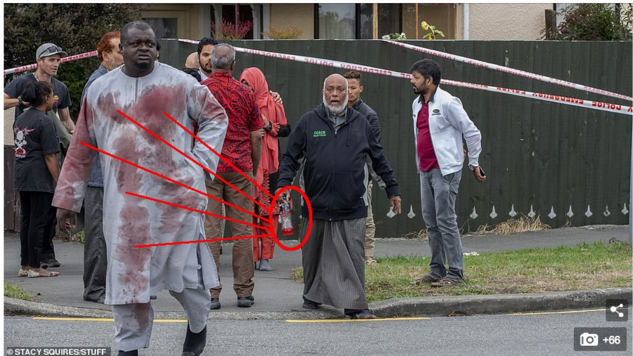
Chilling photos show blood soaked survivors emerging from the Linwood Mosque just minutes after Brenton Harrison Tarrant allegedly opened fire

This single inconsistency is enough to be fatal to the version of the event pushed by the media. However it does not stand in isolation.