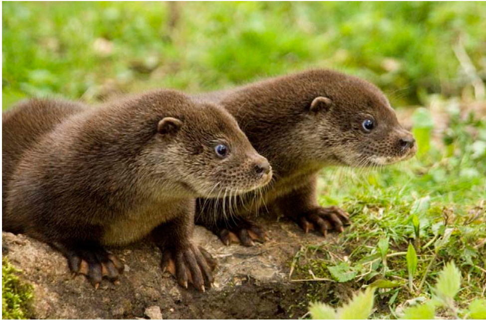
Eurasian Otter Cubs; Chestnut Centre, UK.