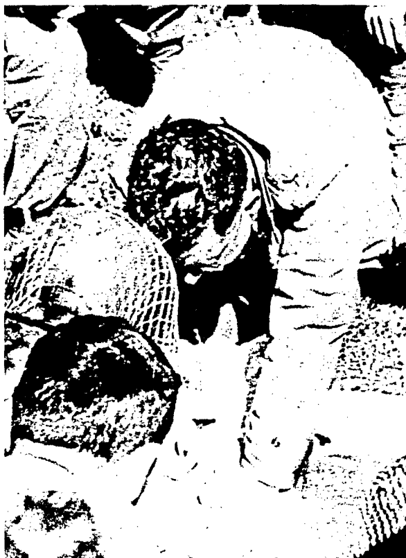
Marshall conducting mass after-action interview after Normandy 1944.