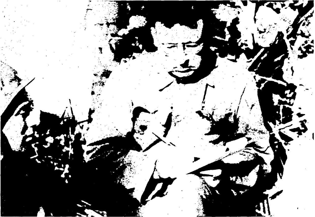
Marshall in the Pacific interviewing two infantrymen c. 1943-44.

details of combat. After one particularly harrowing night of fighting, Marshall discovered that "few of those who were closest to it, including the actual commanders in the battle, knew much more about it than that our men had behaved well in a difficult