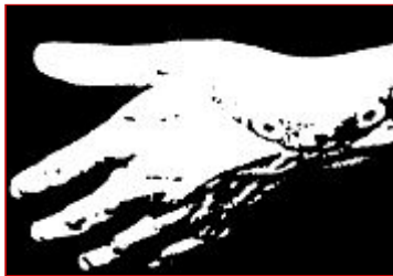
Tattoo that identifies members of the Triad "1 08" group in Singapore

The Mafia had tried to maintain its position in the drug activity, but the Mafia wasn't in a position to buy directly from the prime sources. The Chiu Chau Triads had operated in Saigon and Vietnam during the Vietnam war bringing in drugs for the American soldiers. The Corsican syndicates (organized crime) had connections in Vietnam. They introduced the Mafia to the Triads.